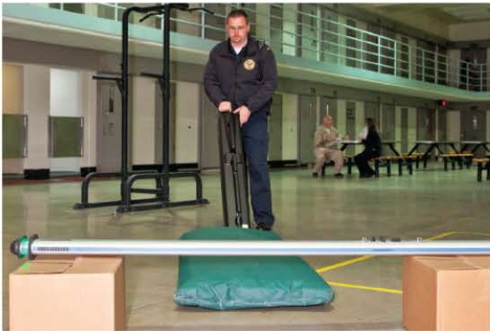
In the accommodation units, Cellsense performs the fastest and most effective bedding search. Slide mattresses under Cellsense to detect the smallest contraband.

Deploy Cellsense vertically, horizontally or at any angle for 360° screening