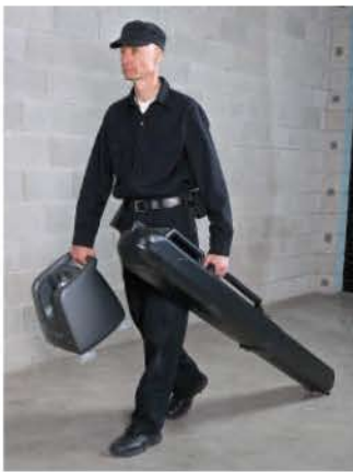
Portable and instantly deployable