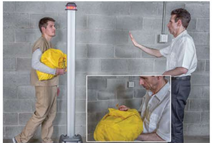
Cellsense will detect contraband within laundry.