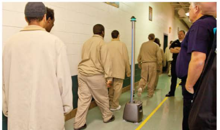
In the dining hall, use Cellsense to thoroughly search 40 inmates per minute in a simple walk-by.