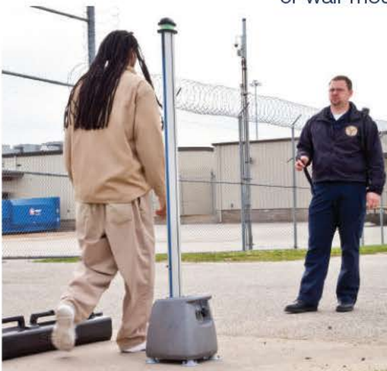
Outdoors, Cellsense works in rain and snow with a 16 hour battery.

Deploy Cellsense to prevent smuggled contraband entry and use throughout the facility. Adapts instantly between freestanding or wall-mounted with unique detachable base