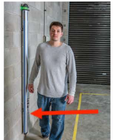
Unit profile is less than 6cm from the wall