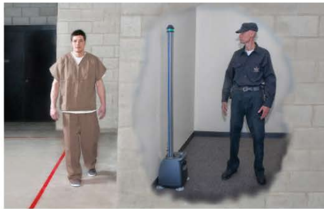
Screen subjects without their knowledge with covert searches behind walls